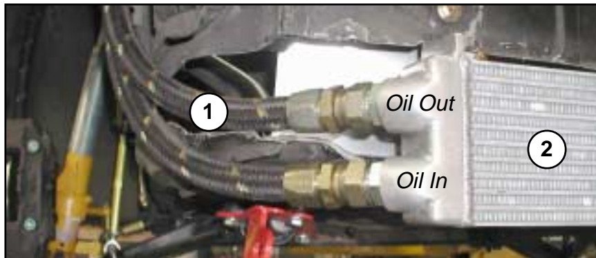
(1) Oil Lines to (2) Front Cooler