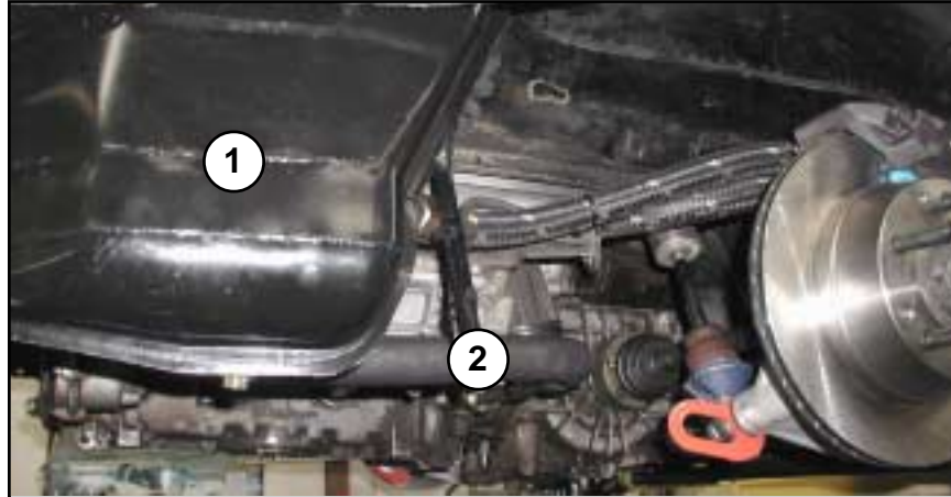
(1) Tank and (2) S hose

Extended Oil Tank, 15° Filter Console, Oil Inlet Adapter Tube, 911 Oil "S" Hose, Oil Inlet Adapter, System 1 Oil Filter, Thermostat, Oil Lines, and Front Mounted Oil Cooler (Also Required But Not Shown - Engine Thermostat Block Off)