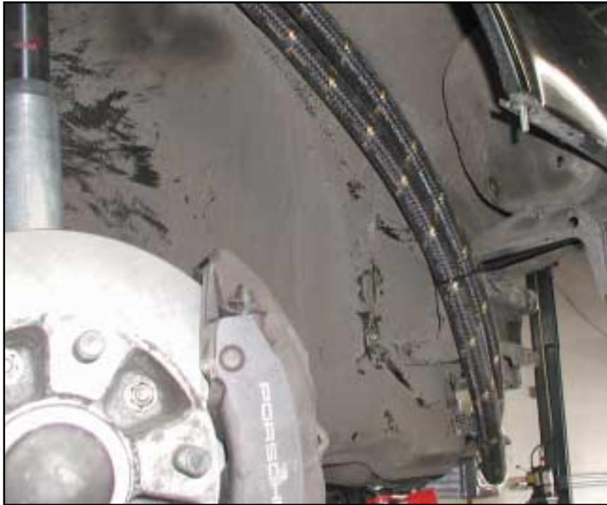
Lines in Front Wheel Well