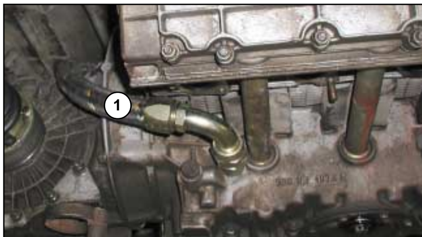
(1) Oil Return Line (Engine to Cooler)