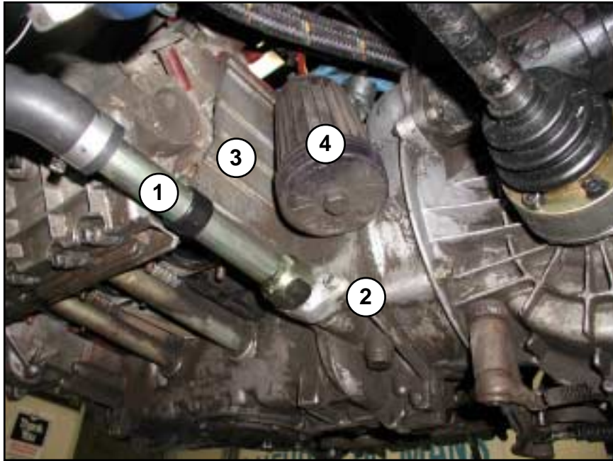
(1) Inlet Adapter Tube, (2) Oil Inlet Fitting, (3) 15° Tilt Console, and (4) System 1 Filter