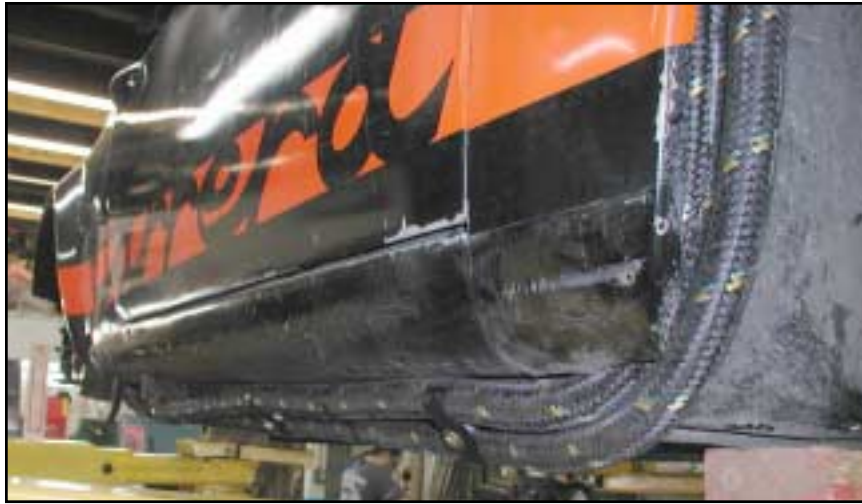
Lines Under Door