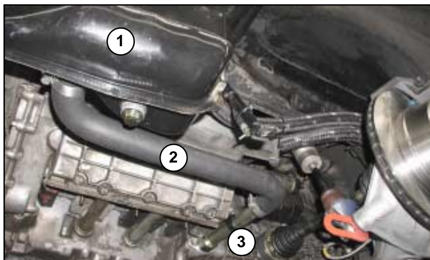
(1) Tank, (2) S-Hose, and (3) Inlet Adapter Tube