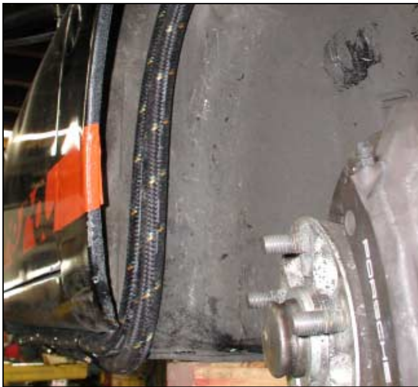
Lines in Wheel Well