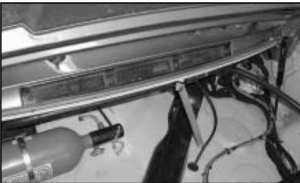
2. Kit installs under air intake on cowl.