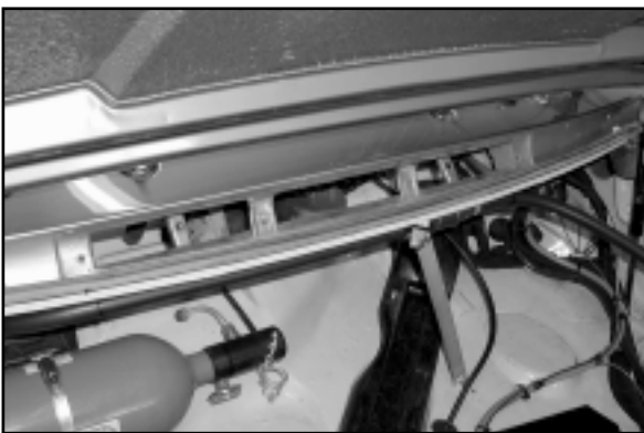
3. Remove grill.