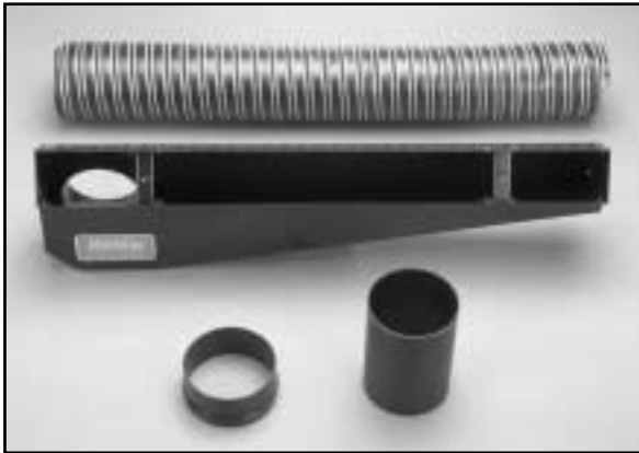
1. Parts included in kit.