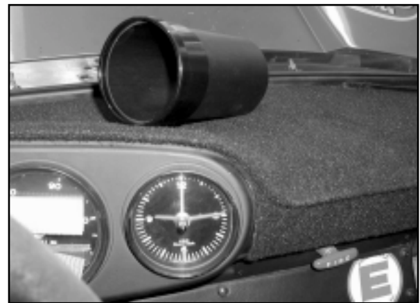
6. With clock removed install ring and tube through dash and attach to hose.

Questions or comments please call 408.369.9997 or FAX 408.369.9741 www.smartracingproducts.com