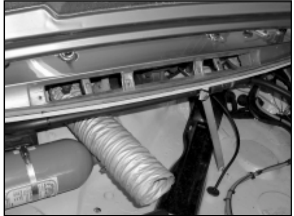
4. Install hose under dash.